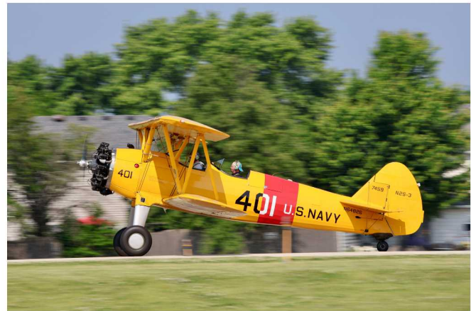
Cavalcade of Planes