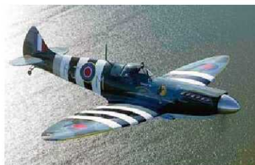
Dwight Davies Supermarine Spitfire Mk 26B