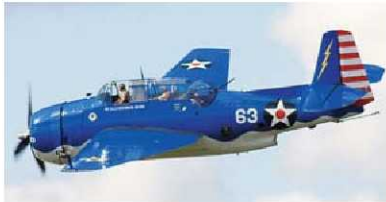
Tom Buck Grumman TBM Avenger

Here are some of the Warbirds owned by Squadron 4 members. Please send yours in if we don't have it! Corrections Welcome!