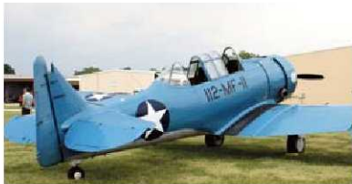
Tom Buck North American SNJ