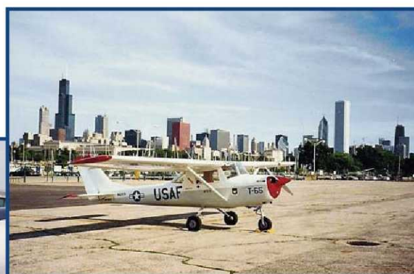
Our COs 150 at Meigs