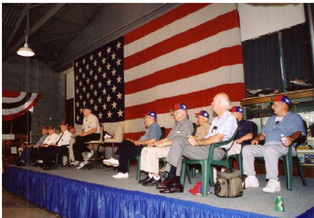
Veterans Honored, Vintage Wings & Wheels Museum