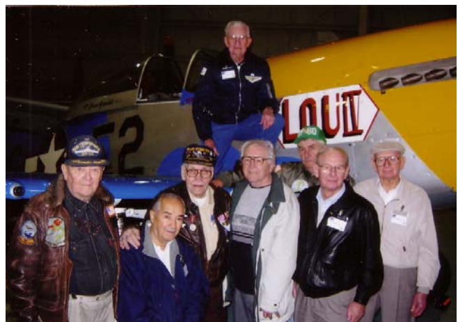
2004 Veteran's Forum honored members